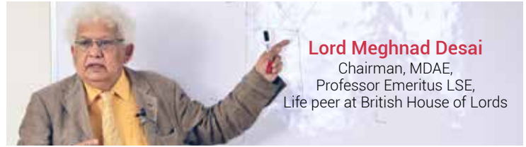
Lord Meghnad Desai Chairman, MDAE, Professor Emeritus LSE, Life peer at British House of Lords