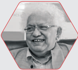
Lord Meghnad Desai, Chairman, MDAE